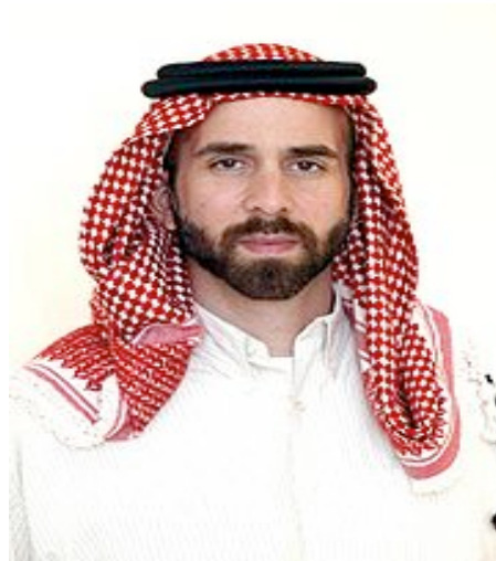
His Royal Highness Prince Ghazi Bin Muhammad